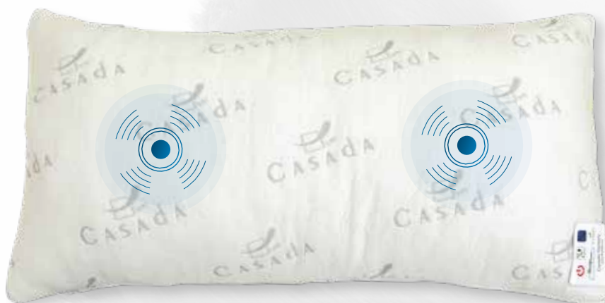
SHREDDED MEMORY FOAM